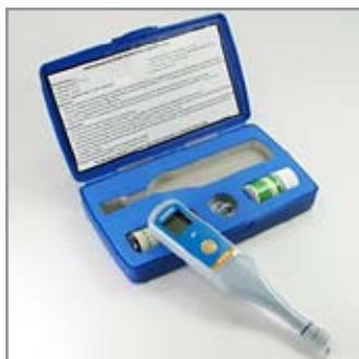
EZIPen-610 pH, Temp