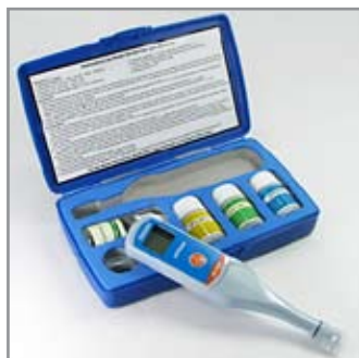
EZIPen-620 pH, Temp