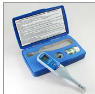
EZIPen-650 EC, TDS, Sal, Temp

Reliable, accurate and economically priced pocket testers are perfect for domestic applications, swimming pools, aquaria, environmental and more.